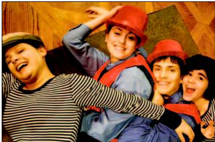
"The Comedy of Errors" is showing in Hampden this weekend.