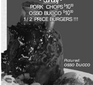
Pictured: osso bucco